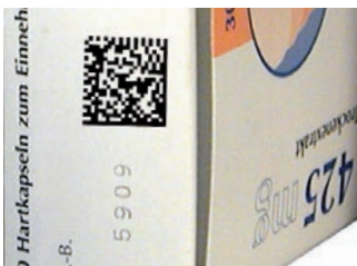
Cartoning B (s. Graphic)

When the blister packs are put into boxes the code is printed on each box and checked by a camera . Hence the smallest packaging unit is labelled.