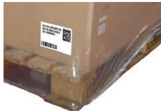
Palletising D (s. Graphic)

At the end of the line the boxes run onto a pallet which is already barcoded. The matrix code data are then linked to the pallet barcode data. A camera records the data matrix code and the barcode on the pallet which are linked with each other in the database.