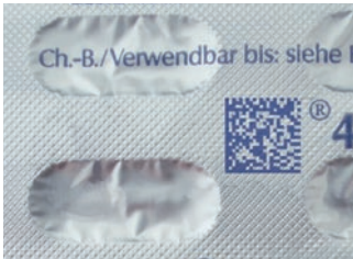
Blister A (s. Graphic)

The data matrix code and the text are then scanned by a camera and linked in the database.