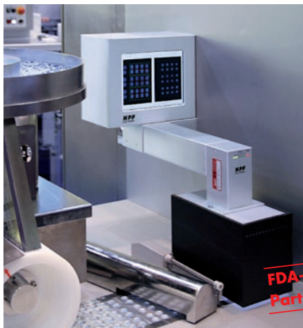
Blister control system Typ EOK-FA 6

New legislation and the growing demands of industry for a reliable value-added chain from producer to patient call for consistent labelling and continuous tracking from start to finish throughout the packaging process.