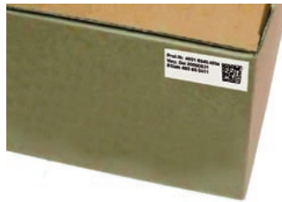
Wrap-around packer C (s. Graphic)

In order to facilitate identification on delivery and distribution, the system labels the boxes when they are processed in the wrap-around packer . The data matrix code is printed on, scanned by a camera and linked in the database.